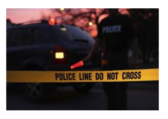
Students Investigating Crimes

A total of two (2) years or six (6) semesters with 60 to 65 credits hours. A holder of an associate's degree can transfer to a Bachelor's degree program after graduation at any institutions in the United States or Canada.